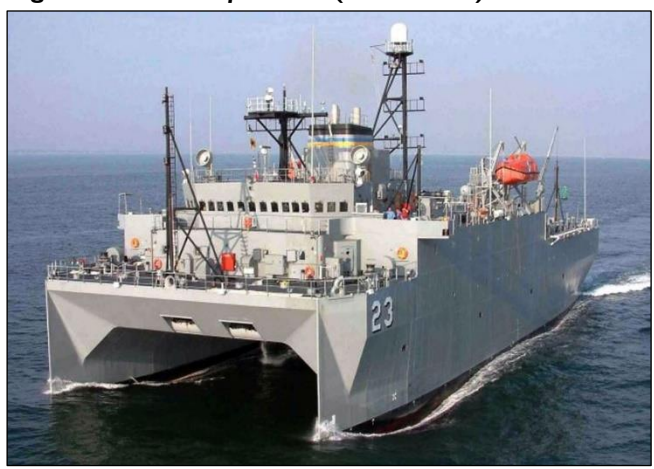
Figure 1. USNS Impeccable (TAGOS-23)