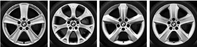
SA2C9 SA2LD SA2RX SA2RY